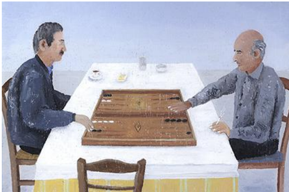
Backgammon (oil on wood 30 x 20 cm)